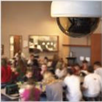
Binkley Alarm provides residential and commercial video surveillance systems that are customized to your needs and applications.