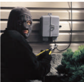
Do you have a backup? Call us and ask about phone backup options for your alarm system today.

Binkley Alarm has been providing Sonoma, Lake and Mendocino Counties service since 1968.