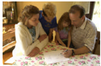
Make sure that everyone knows how to secure the home.

Securing accessible windows with blocking devices that have no more than 6 inches for ventilation is advisable. Make sure that the burglar can't reach through to open a door or remove the window blocking. Anti-lift devices for windows should also be considered.