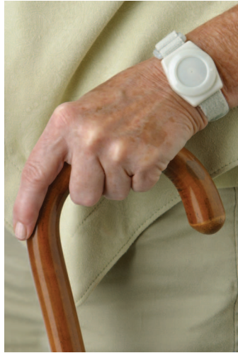
Just press a button and a wireless message goes out to the CareGard panel. Within seconds, an operator responds to your needs.