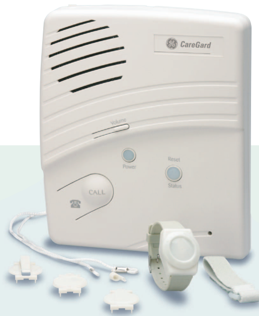
CareGard Contains: 1- CareGard Panel, 1- Personal Call Button and 1- User Manual

Rushing to answer the phone can be dangerous if you have health or mobility issues. CareGard lets you answer the phone from anywhere by simply pressing your Call Button. Talk immediately through the hands-free speakerphone, then take your time getting to the telephone.