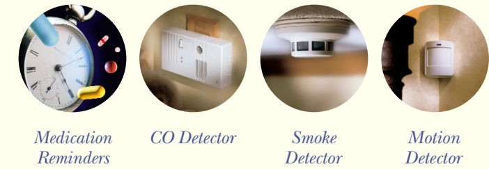
Medication Reminders CO Detector Smoke Detector Motion Detector

For even greater protection, you can add special features like medication reminders, smoke detectors and carbon monoxide sensors. There are activity sensors that send a call for help if you're not moving around as much as usual. You can even add freeze and flood sensors to protect your home when you're away.